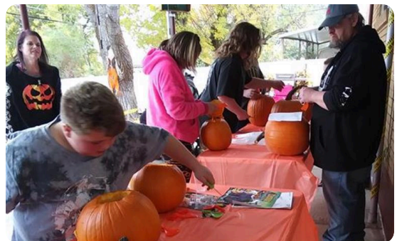
Pumpkin Carving 2020