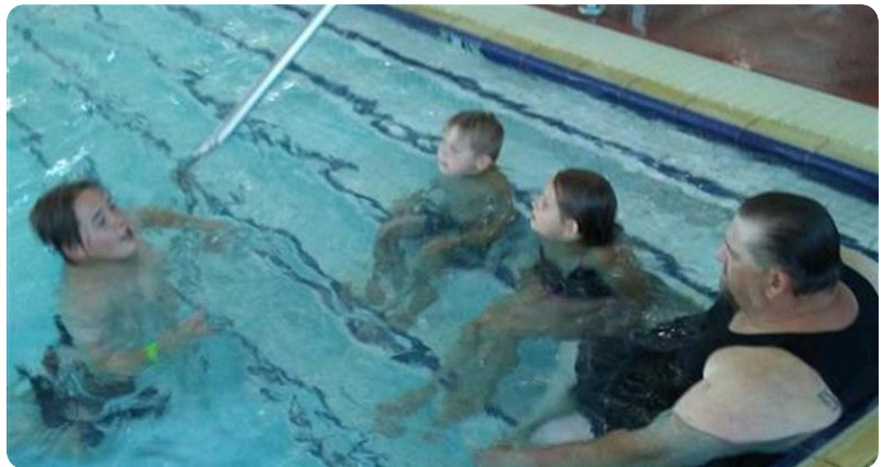
Swimming at the rec center